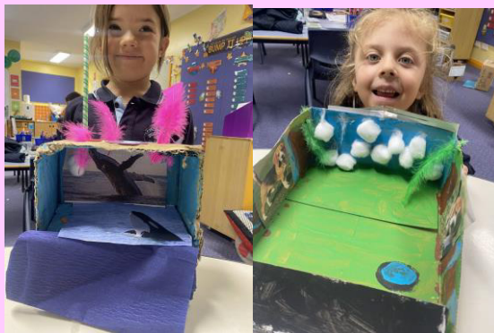
Infants Class Animal Habitats